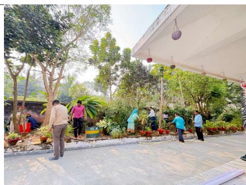
Cleaning activity inside the compound of the temple

On Day-12 (i.e., 27-12-2025) of the on-going swachhta pakhwada , scientists and staff of ICAR-IIWM came together to clean up Sri Jagannath temple premises located in Rail Vihar, Bhubaneswar. First, an assessment of the premise was done to plan the cleaning activity. Subsequently, staff of IIWM using different hand tools removed polythene bags, puja related waste material, dry leaves and branches of plants, broken earthen diyas and disposed of in the designated spots. The tiled floor in the premise was also cleaned. This was followed by cleaning up of the adjoining where used-paper plates, polythene bags, used flowers from the temple were cleaned and disposed in appropriate place. The President of Rail Vihar Sri Jagannath temple trust Shri Nihar Ranjan Mishra and the Secretary extended their full cooperation in undertaking programme. A total of 18 numbers of IIWM staff participated in the programme. Some of the action and activity photographs of Day-9 are presented below.