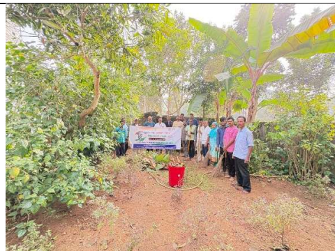
Shramdaam in the adjoining area of the Jagannath temple