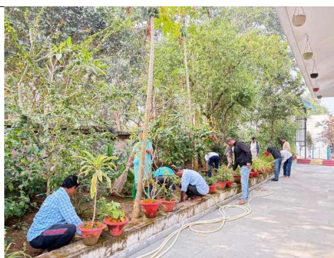
Cleaning activity of the temple premises